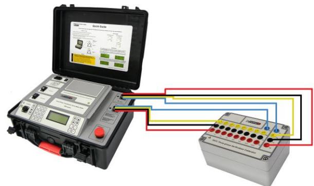
Connecting TRT with 1 connector for H cables and 1 connector for X cable

TRTs with 1 connector for H cables and 1 connector for X cables